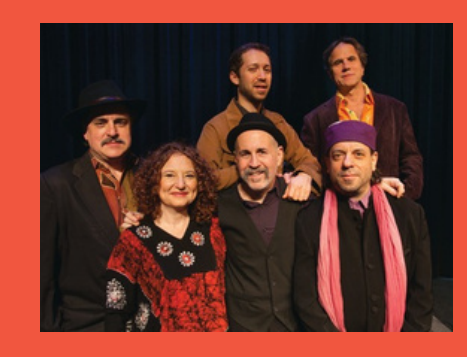
The Klezmatics 12/7 at 7:30 PM Hanukkah Dance Party