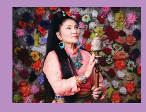
Yungchen Lhamo 1/26 at 7:30 PM Soul-Stirring Tibetan Sounds